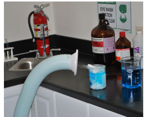
The Floor Sentry sits on the floor nearby providing fume extraction without taking up vital benchtop space.