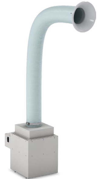
Model 200/225 Floor Sentry

This Floor Sentry Fume Extractor provides a highly energy-efficient, quiet, and economical solution to many operations that require fume extraction. This system is also available with dual arms [SS-200/225-FSD] for multiple operators.