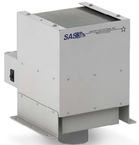
Model 200/225 Mounted Sentry

The Mounted Sentry provides a highly energy-efficient, quiet and economical solution to many fume extraction needs. Larger Mounted Sentry models are also available [SS-300-MS & SS-400-MS].