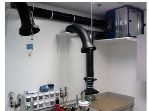
The Mounted Sentry (Model 400 shown here) can be mounted on the wall and outfitted with fume extraction arms.