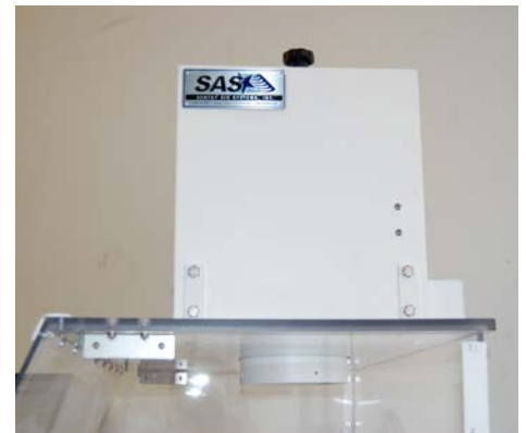
Mounted Sentry (Model 300 shown here) on top of an enclosed fume hood.