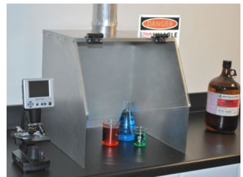
Ducted Fume Hood made custom out of stainless steel