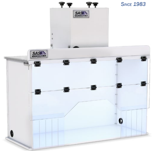
Custom hood with multiple hinges and custom cut-out with side vinyl curtains