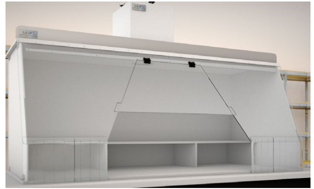
Custom front cut-outs, custom hinged top, and internal shelving.