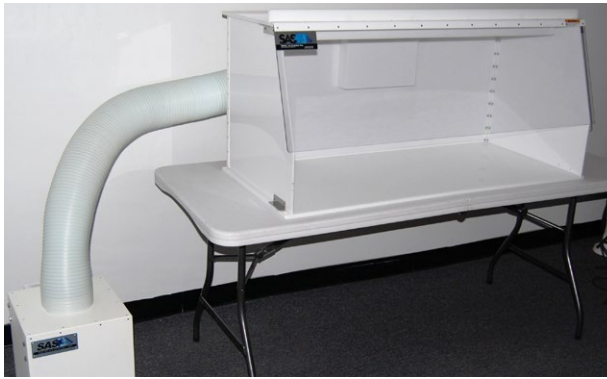
Custom ductless fume hood external blower ducted to the hood.