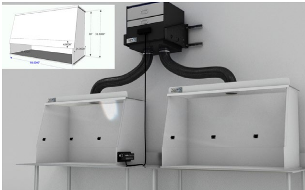
Model 400 wall mounted air cleaner ducted to two custom ductless fume hoods.