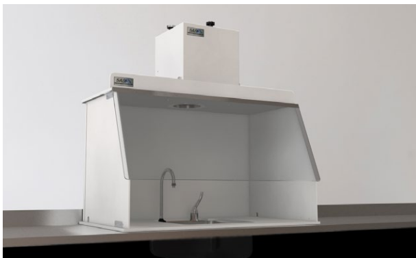
Custom ductless fume hood with sink cutout.