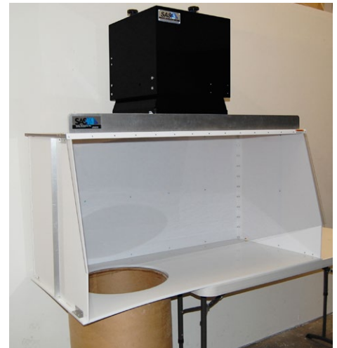
Custom Cutout with Upgraded Model 400 Blower System