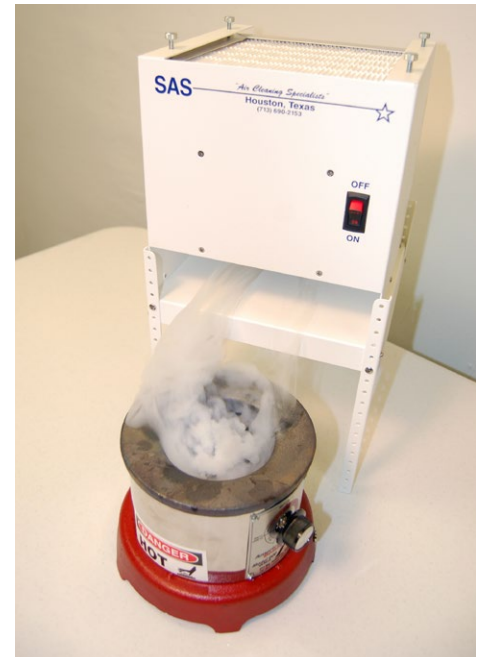
Model 100 Solder Pot Sentry drawing in fumes into the filtration system away from the operator.