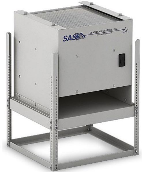
Model 100 Solder Pot Sentry

The Solder Pot Sentry offers an effective, quiet, and economical fume extraction solution for many benchtop soldering operations. All of Sentry Air's products are proudly manufactured in the United States and are backed by our two-year limited warranty on parts and labor.