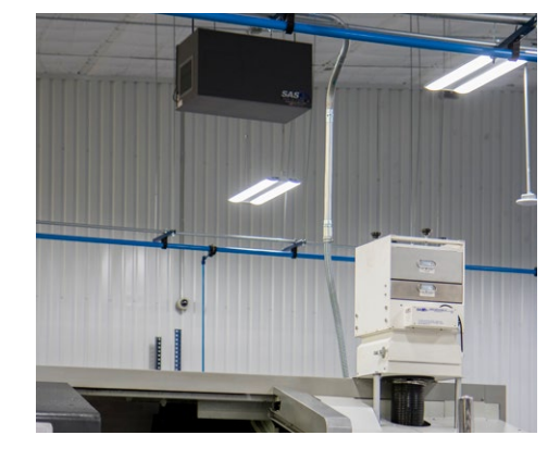
Model 2000 Ambient Mist Collector provides additional support for mist collection in CNC machine shops.