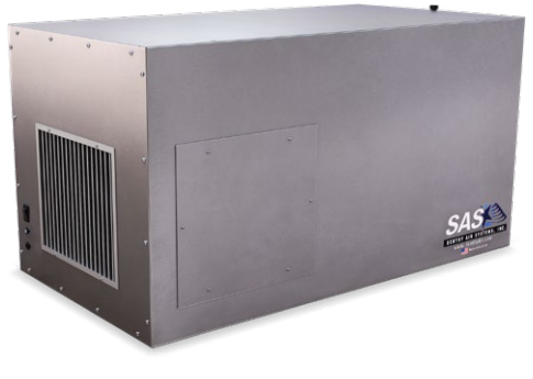
Model 2000 Ambient Mist Collector

This unit has been stringently tested and evaluated by a third-party to verify that all internal components are able to withstand a moist environment.