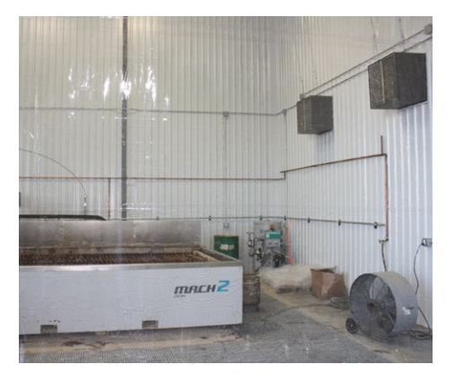
Model 2000 Ambient Mist Collector collects more than just oil mist, this system can be used for waterjet machines.