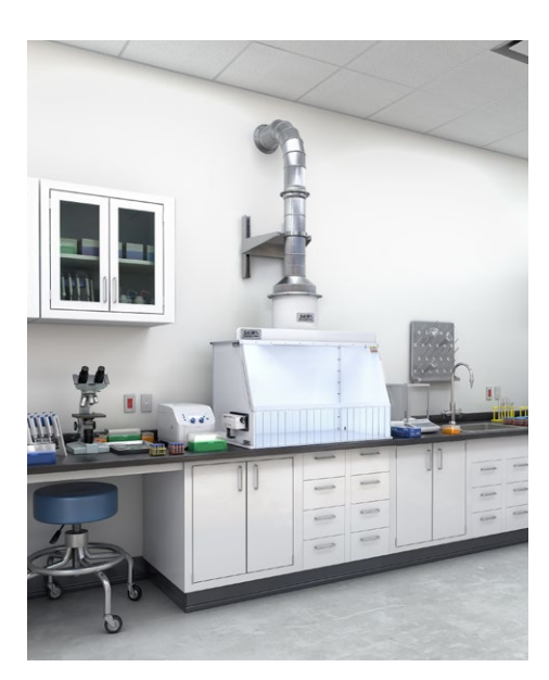
Inline Exhaust Fan attached to Ducted Fume Hood in a lab setting