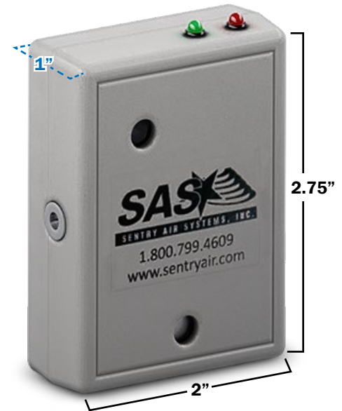
Acetone Gas Sensor

Note: The Acetone Gas Sensor is calibrated for Acetone-specific applications. It is important to note that the Low Odor Threshold of Acetone usually occurs around 20 PPM. Acetone is known to evaporate at room temperature. This means that the operator is likely to smell acetone odors well before the room reaches either NIOSH or OSHA exposure limit thresholds.