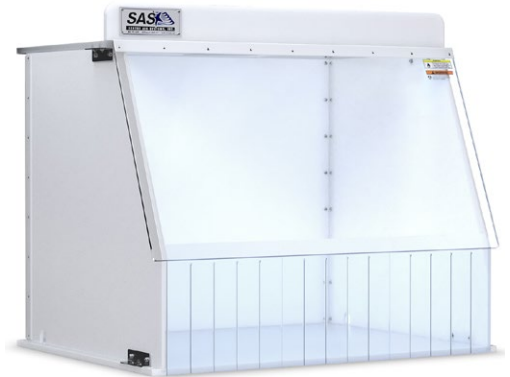
30" Ducted Fume Hood (shown with optional vinyl curtains)