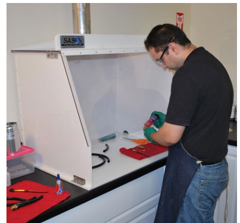
Ducted Fume Hoods can help protect operators from harmful epoxy fumes.