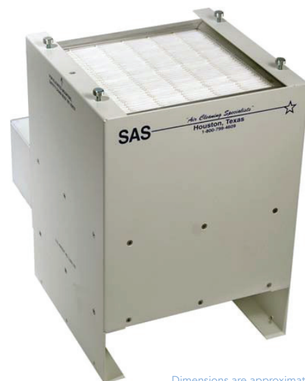
Dimensions are approximate

The Model 200 Portable Room Air Cleaner can provide an effective and economical solution for many commercial, medical, laboratory and industrial ambient air cleaning applications.