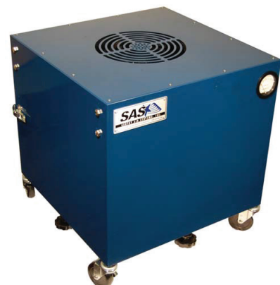
Dimensions are approximate Shown with Optional Features

The Model 400 Portable Room Air Cleaner can provide an effective and economical solution for many commercial, medical, laboratory and industrial ambient air cleaning applications. Two smaller models [SS-200-PRAC & SS-300-PRAC] and one larger model [SS-450-PRAC] are also available.