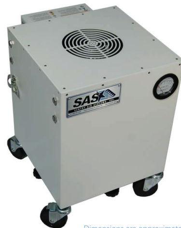
Dimensions are approximate Shown with Optional Features

Typical uses for this room air cleaner include hospital air cleaner, laboratory air cleaner, office air cleaner, general room air cleaner, dust control, odor control and a variety of applications involving chemical fumes and particulate. The Model 300 Portable Room Air Cleaner can provide an effective and economical solution for many commercial, medical, laboratory and industrial ambient air cleaning applications.