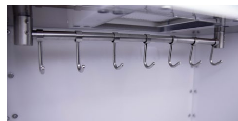
Stainless Steel IV Bag Rod (7 hooks shown, 10 hooks on 30" model)