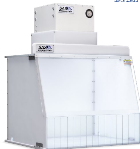
30" Wide IV Hood