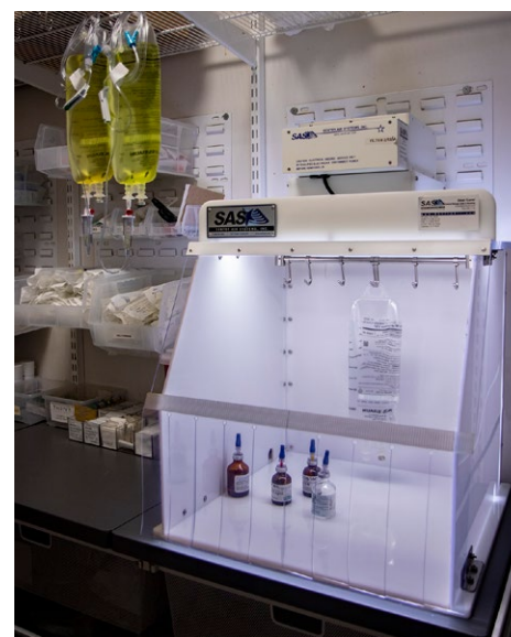
IV Hood with IV Bags (18" Model Shown)