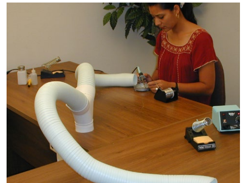
Model 200 Mounted Sentry Double allows fume extraction for two operators for a variety of applications.