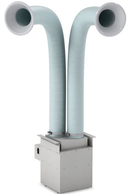
Model 200 Mounted Sentry Double

A single arm model [SS-200-MSS] and a larger unit [SS-300-MSD] are also available.