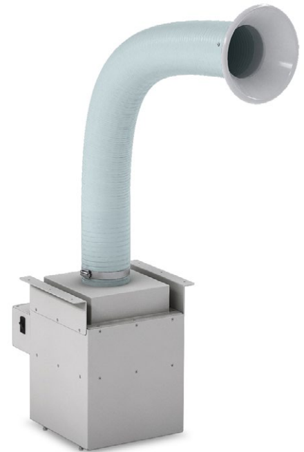
Model 200 Mounted Single Sentry

A larger model [SS-300-MSS] and a dual-arm unit [SS-200-MSD] are also available.