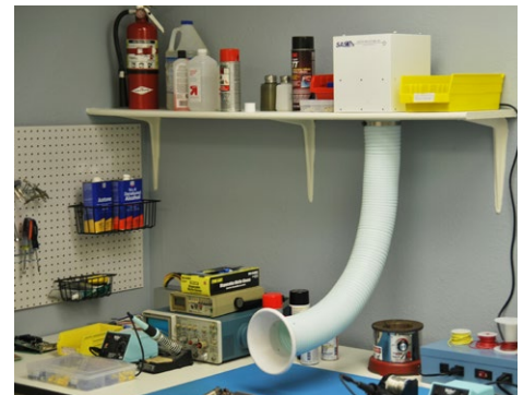
Model 200 Mounted Single Sentry easily mounts on the wall to free up benchtop space.