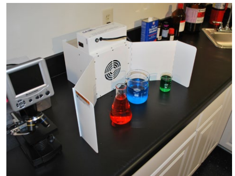
The Winged Sentry provides chemical fume extraction for a variety of benchtop applications.