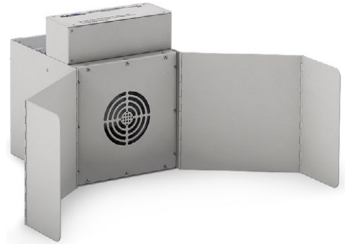
Model 200 Winged Sentry

The Winged Sentry provides a highly energy-efficient, quiet and economical solution to many fume extraction needs. An optional transparent hinged lid [SS-200-WSL] is available to further enclose the source capture area. This unit is also available with a more powerful fan and filtration system [SS-300-WS].