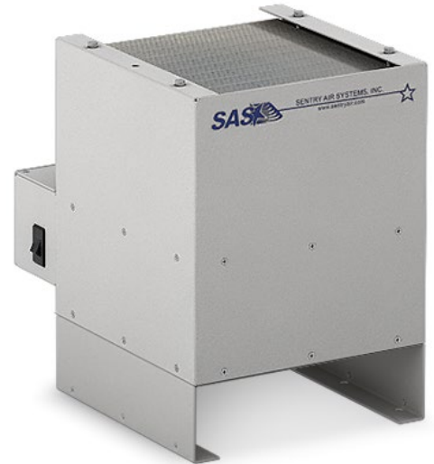
Model 200 Smoke Sentry

As a companion to the Smoke Sentry , our line of portable and free-hanging room air cleaners offer added air filtration for indoor spaces.