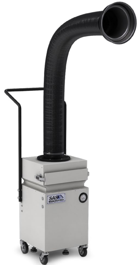
Model 300 Welding Fume Extractor with Dust Plenum