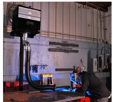
Model 400 Mounted Sentry frees up valuable benchtop space with fume extractor stand.