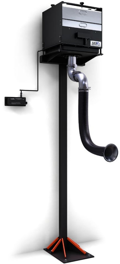
Model 400 Mounted Sentry Fume Extractor with Stand

As an option, this system can have a 7' Heavy Duty Extractor Arm equipped for greater reach and higher volume fume extraction applications.