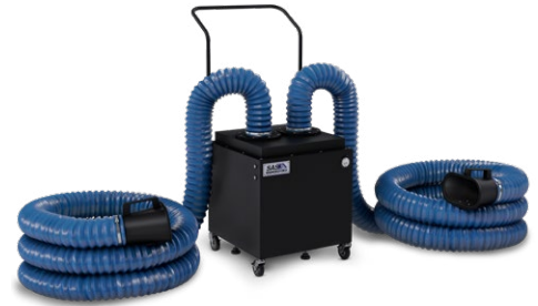
Model 400 Dual Python Portable Floor Sentry

This Model 400 Dual Python Portable Floor Sentry combines energy-efficient technology and a unique design to ease fume extraction in hard-to-reach areas for two operators. Also available is a larger model [SS-450-PYTD] and a model with a single extraction hose [SS-400-PYT].