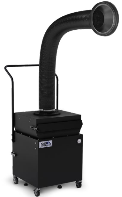
Model 400 Welding Fume Extractor with Dust Plenum

This unit is also available without the dust plenum [SS-400-WFE] and as a more powerful unit [SS-450-WFE]. For high volume applications, the Industrial Welding Fume Extractor [SS-500-WFE-MP1] includes a set of cleanable filters and a 10' heavy-duty extractor arm.