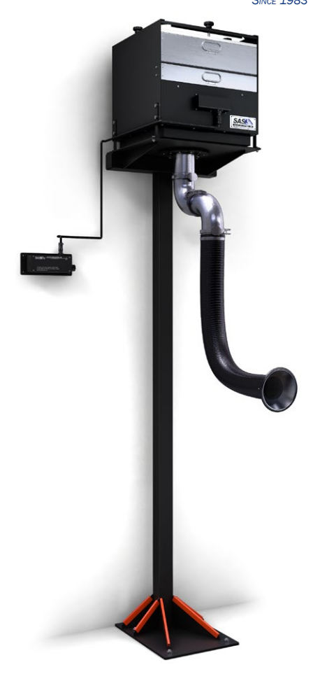
Model 450 Mounted Sentry Fume Extractor with Stand