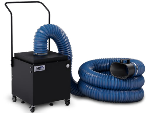
Model 450 Python Portable Floor Sentry