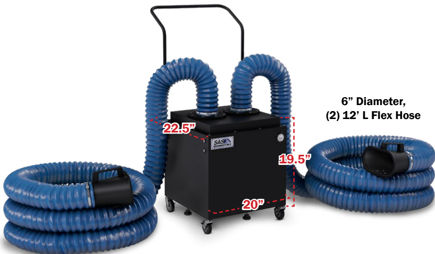
Dimensions are approximate