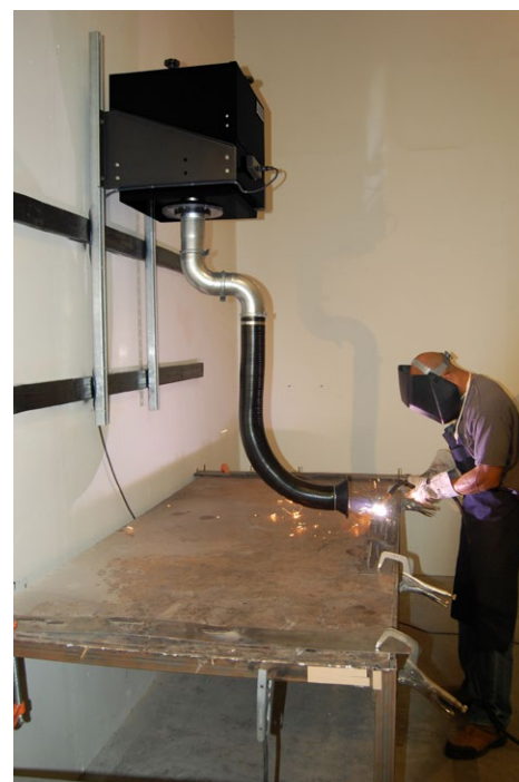
Model 450 Sky Sentry provides source capture fume extraction without taking up valuable benchtop space.