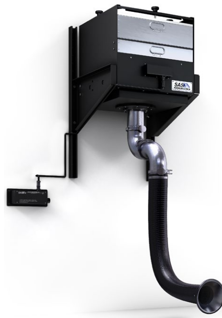
Model 450 Sky Sentry

Three smaller models [SS-200-SKY, SS-300-SKY, & SS-400-SKY] are also available. This system is also available with an outlet plenum.