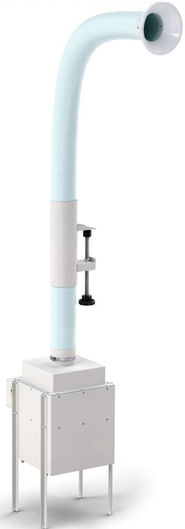
Model 200 Snorkel Sentry

The Snorkel Sentry provides a highly energy-efficient, quiet and economical solution to many fume extraction needs.