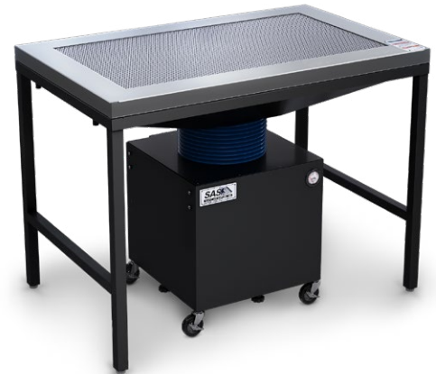
30" Industrial Downdraft Bench