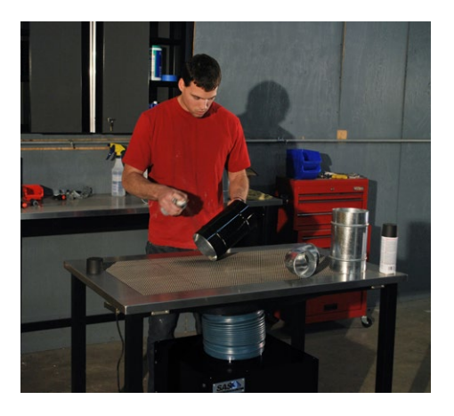
The Industrial Downdraft Bench provides fume extraction for use with chemicals, solvents, and aerosol sprays.