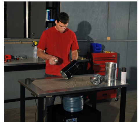
The Industrial Downdraft Bench provides fume extraction for use with chemicals, solvents, and aerosol sprays.