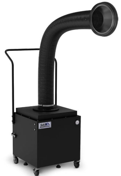
Model 450 Portable Floor Sentry

A smaller model [SS-300-PFS] and a larger model [SS-500-WFE-MP1] are also available.