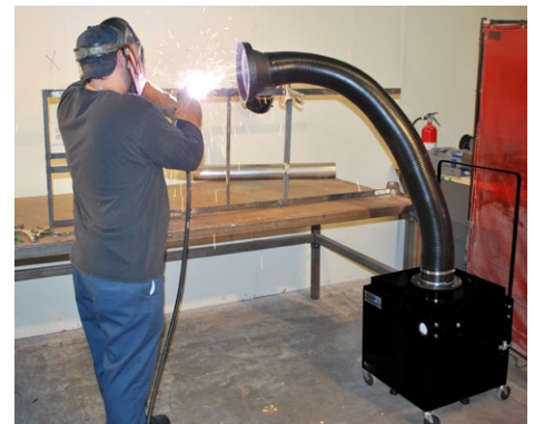
The Model 450 Portable Floor Sentry helps protect the operator from fumes by extracting at the source.