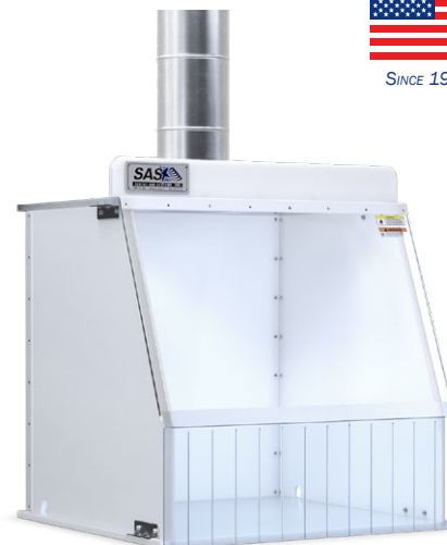
24" Ducted Fume Hood (shown with optional vinyl curtains)