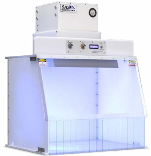
40" Portable Clean Room UVC