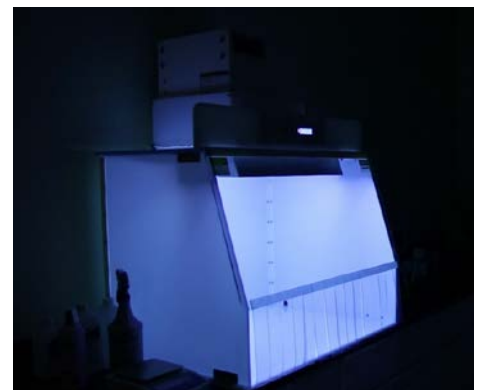
PCR with UVC Light Activated