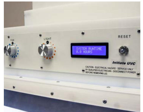
Control Panel with UVC Light Controls