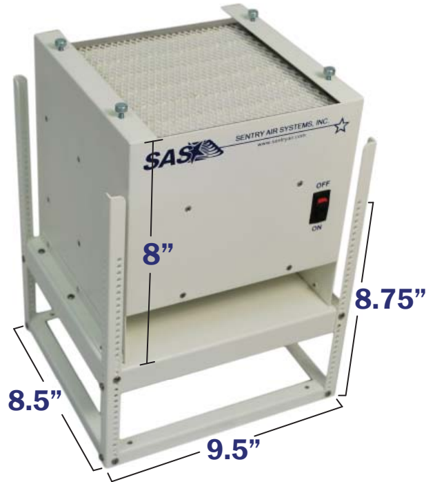
Dimensions are Approximate