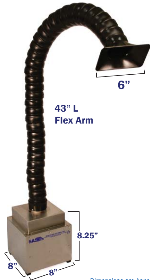
Dimensions are Approximate