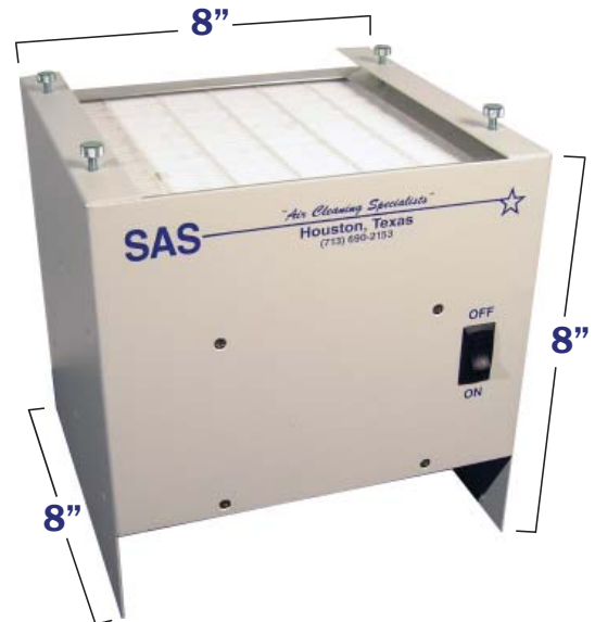
Dimensions are Approximate