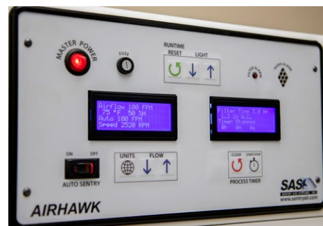
AirHawk's Advanced Control Panel