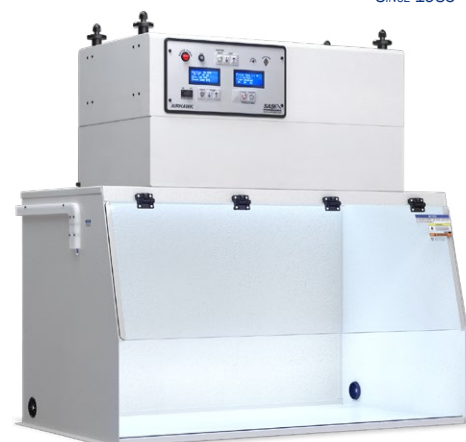
40" AirHawk Ductless Fume Hood

Typical applications for the AirHawk include chemical fumes, pharmaceutical compounding, soldering, light dust removal, biological, solvent or epoxy use, and many more applications that require the removal of fumes and particulate. Upgrade your respiratory protection to the AirHawk and experience an improved workflow with the automatic features and beneficial user configurations.