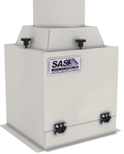
Model 300 Exhaust Filter Box

By adding filtration such as HEPA filters , facilities can help reduce particulate build-up in the ductwork. Ductwork build-up can lead to costly maintenance and cleaning procedures as well as machine downtime. Particle build-up can also potentially cause safety concerns. Also, adsorbing chemical or caustic gases with Activated Carbon filters can help improve the environmental impact by reducing the fume concentration released into the atmosphere and helping improve exhaust air sampling.