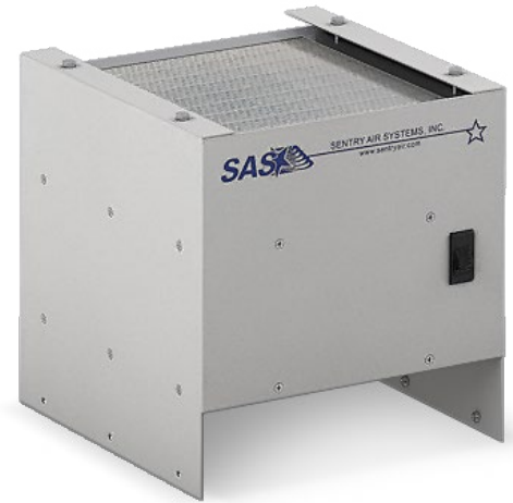
Model 100 Solder Sentry

An optional adjustable height stand is available for elevated operations such as solder pot applications. The Solder Sentry offers an effective, quiet, and economical solution for many benchtop soldering operations which require fume extraction. All of Sentry Air's products are proudly manufactured in the United States and are backed by our two-year limited warranty on parts and labor.