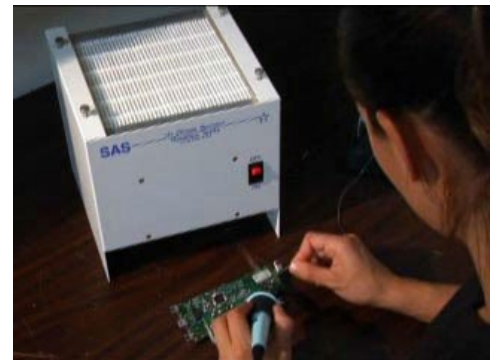
Operator using Model 100 Solder Sentry to protect from hazardous soldering fumes.