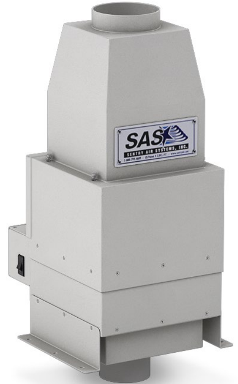
Model 200 Mounted Sentry with Plenum