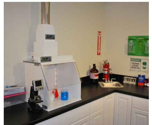
Mounted Sentry with Plenum can be used to exhaust out harmful fumes and particulate.