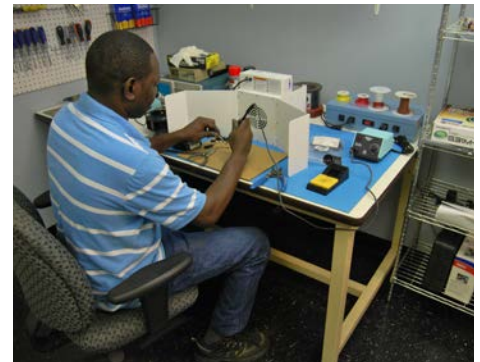
The operator is using the Model 200/225 Winged Sentry to direct soldering fumes away from his breathing zone.