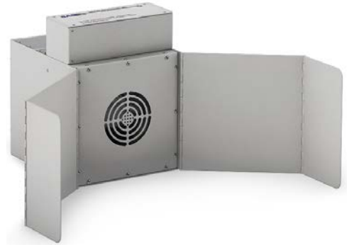
Model 200/225 Winged Sentry

The Winged Sentry provides a highly energy-efficient, quiet and economical solution to many fume extraction needs. An optional transparent hinged lid [SS-200/225-WSL] is available to further enclose the source capture area. This unit is also available with a more powerful fan and filtration system [SS-300-WS].