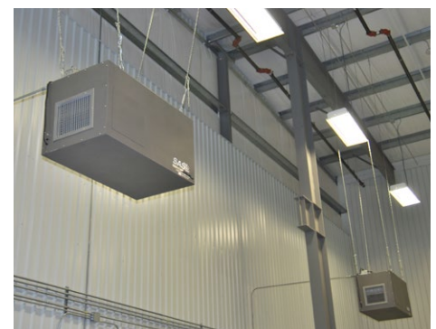
Model 2000 Air Cleaner can be mounted in several ways including hanging from the ceiling.