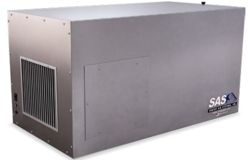
Model 2000 Free-Hanging Air Cleaner

In-house factory testing in a 40,800 ft 3 workshop in Houston, TX indicated an 87% reduction in airborne particulate after 50 minutes with two model SS-2000-FH units.