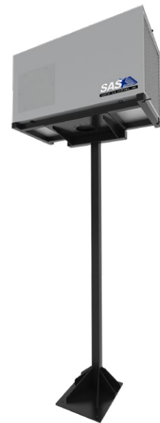
Model 2000 Air Cleaner mounted on Fume Extractor Stand [SS-091-FES]