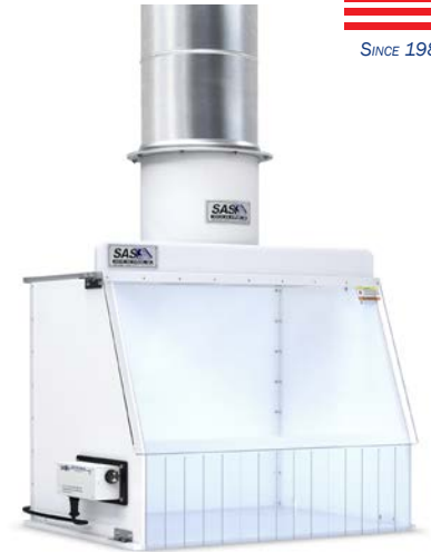
30" Powered Exhaust Hood with Inline Fan