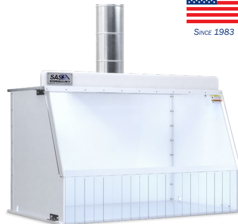
40" Ducted Fume Hood