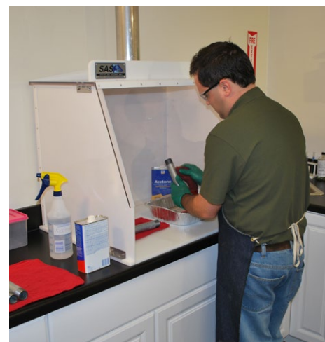
Ducted Fume Hoods provide useful fume extraction for various applications (30" pictured).