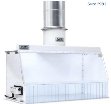
50" Powered Exhaust Hood with Inline Fan