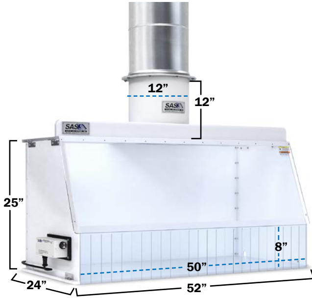
Shown with outer dimensions. Dimensions are approximate.