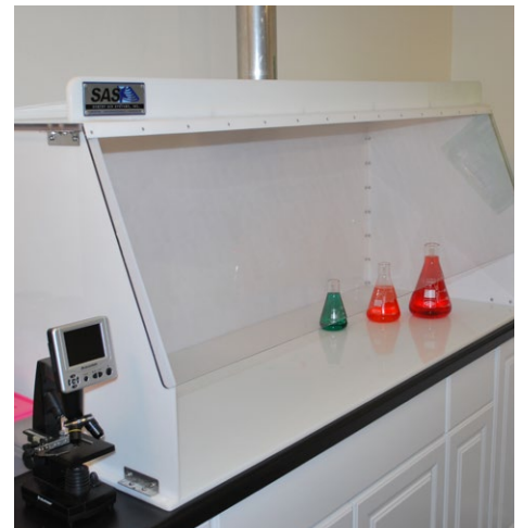
Ducted Fume Hoods provide fume extraction for various applications incl. using chemicals & lab processes.