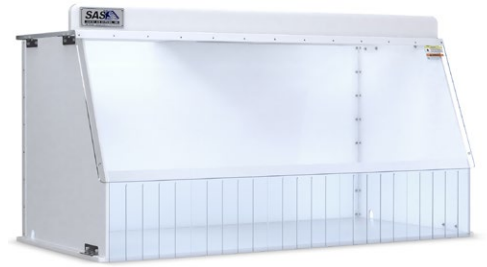
50" Ducted Fume Hood (shown with optional vinyl curtains)