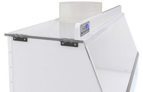
Side view of the 50" Ducted Fume Hood showing the 8" Exhaust Collar.