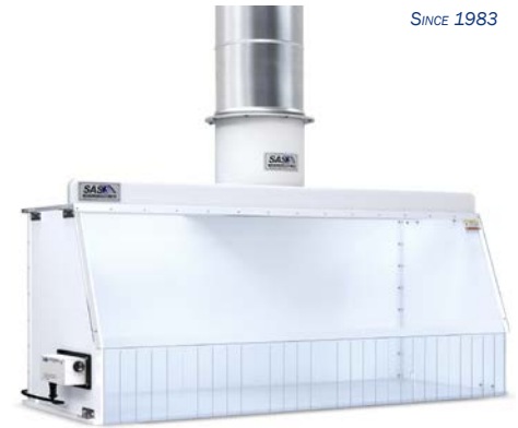
60" Powered Exhaust Hood with Inline Fan