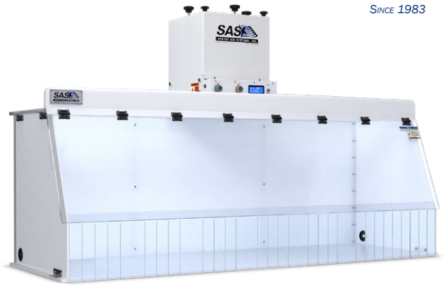
70" Ductless Fume Hood - Generation II

Generation II helps protect the operator and environment from hazardous fumes or particulate generated from applications performed within the hood. The new and improved design of this fume hood includes an adjustable light, variable speed fan control, and a digital display with an hour counter and digital magnehelic gauge. The adjustable light and fan controls enable the operator to make modifications suitable for the application. The digital hour counter shows the time the unit has been operated in hours to keep PM schedules for filter changes. The digital magnehelic gauge measures the static pressure on the filter in order to monitor the filter saturation. This unit also features an external reset button and programmable alerts.