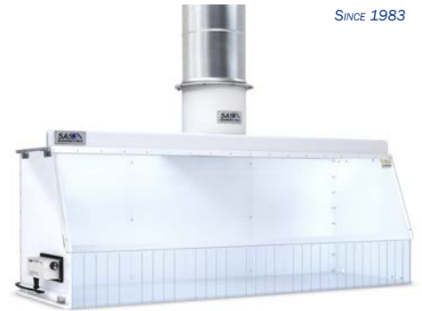
70" Powered Exhaust Hood with Inline Fan