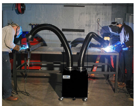
The Floor Sentry Double provides powerful fume extraction for two operators working near each other.