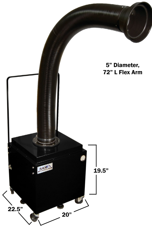
5" Diameter, 72" L Flex Arm

Dimensions are approximate Shown with optional accessories