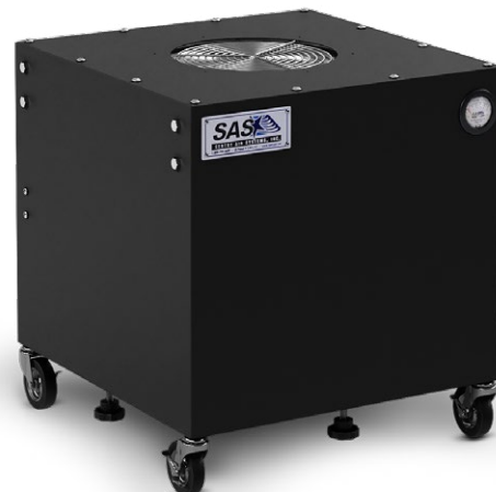
Model 450 Portable Room Air Cleaner

The small footprint of the Portable Room Air Cleaner makes it an ideal choice for smaller environments that require air purification. The Model 450 Portable Room Air Cleaner can provide an effective and economical solution for many commercial, medical, laboratory and industrial ambient air cleaning applications. Three smaller models [SS-200-PRAC, SS-300-PRAC, & SS-400-PRAC] are also available.