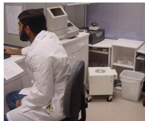
Portable Room Air Cleaner provides vital air cleaning for numerous applications. (SS-300-PRAC shown).