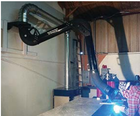
Wall Mount Bracket with 10' L HD Arm ducted to a Model 550 Industrial Fume Extractor

The Heavy Duty Wall Mount Bracket is designed to mount directly to a wall with the ability to attach a variety of one of our source-capture fume arms. A series of adapter collars coupled with multiple hole patterns make the bracket modular depending on the arm type needed.