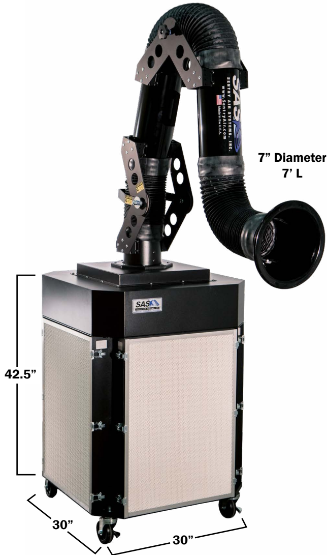
Dimensions are approximate.