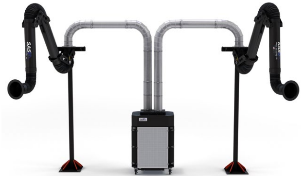
Model 500/550 Dual Stand Assembly

The Model 500/550 Dual Stand Assembly provides powerful fume extraction for heavy duty applications such as production welding (MIG, TIG, stick, plasma cutting), grinding, powder weighing, classroom settings, soldering and brazing stations, some dust collection applications, and more.